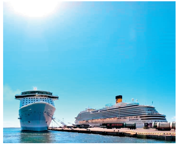
And the winner 15...

During this summer, it has hit its all time record of over 1,300 passengers in homeport operations. This a proof of operations success at the port and will be a base for future transit & turnaround operations.